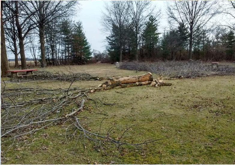
Dead ash trees rapidly deteriorate. When killed by EAB, trees need to be removed soon to prevent hazards.

- Does this tree provide valuable services that cannot easily be replaced? Large trees that are providing shade to a house, deck, pool, etc. are hard to replace in a timely manner. Trees provide many other benefits to properties as well, so a good resource to check the monetary value a tree is providing your property, and help to determine if a treatment is a good financial option, is http://www.treebenefits.com/calculator/