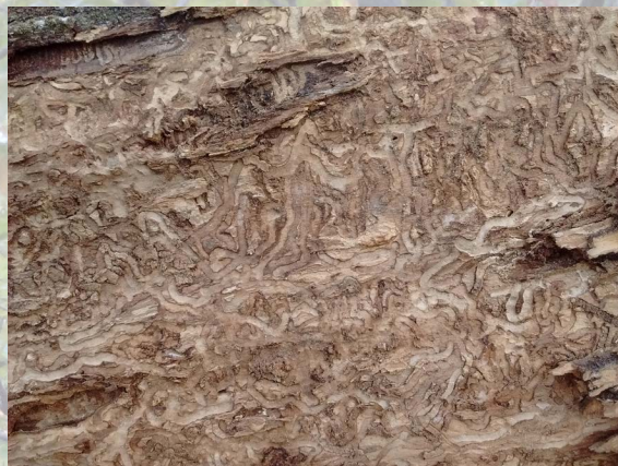
Galleries, created by larval feeding, when excessive can interrupt nutrient and water flow in a tree, leading to tree death

- What would the loss of this tree mean to me? Sometimes trees have special value beyond economics. It could have been planted by a loved one, or been the site of a kid's wedding. If losing the tree would be a significant emotional loss, then it is likely worth saving.