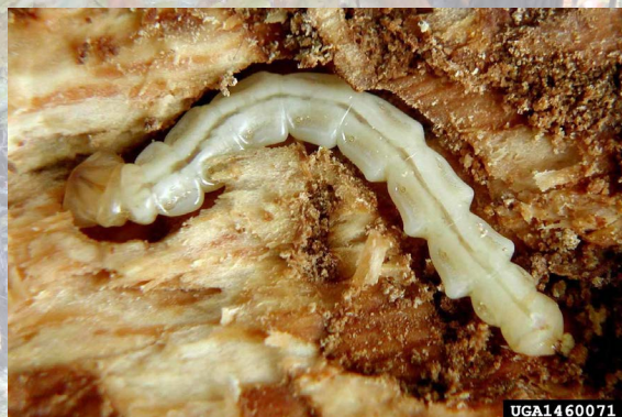
Larvae mostly feed just under the bark in the cambial and phloem layers of the tree.