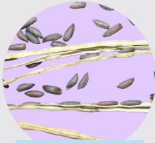
DORMANCY Fall - Spring