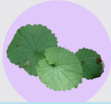
SEEDS GERMINATE February - April