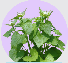
STALKS BOLT March - April