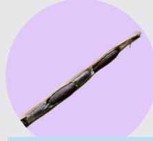
SEEDS RELEASED May - July