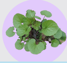
BASAL ROSETTES FORM May - June