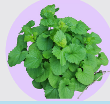
BASAL ROSETTES GROW September - March