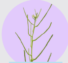
SEEDS FORM May - June