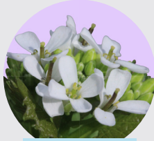
FLOWERING April - July