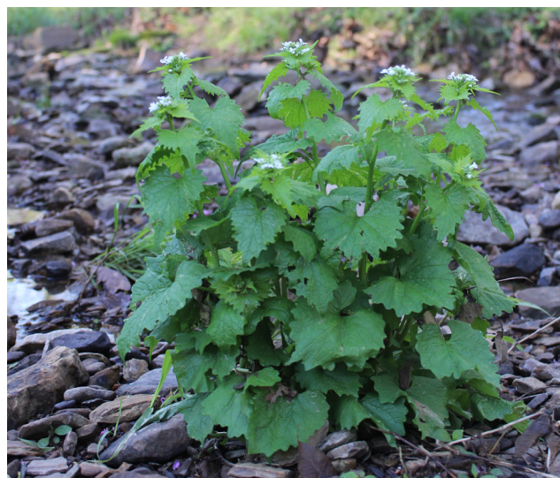
Garlic mustard spreads easily and is hard to remove.

Report sightings: Learn what invasive species are in your area and report sightings with the EDDMaps app or online at www.eddmaps.org .