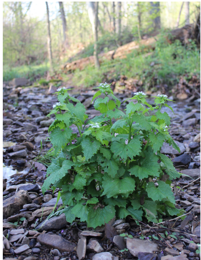
Garlic mustard seeds spread easily and plants are difficult to remove once established.

Garlic mustard is native to Europe and was first recorded in North America in 1868. This potherb was historically eaten in early spring when few greens were available. It was first reported in Illinois in 1918 and by the late 1980s was recognized as a problem species. As of 2022, garlic mustard has been reported in 70 of Illinois' 102 counties. Eight states have declared this invasive as a prohibited or noxious weed. Illinois does not currently mandate or regulate it.