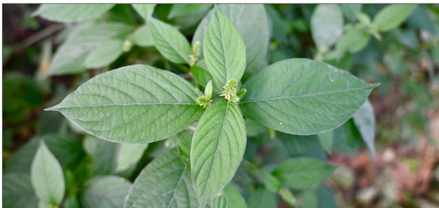
Fig. 4. Chaff flower has opposite leaves with smooth margins and prominent venation.

This species is also an exotic invasive. The vegetative parts look very similar to chaff flower. Key distinguishing features: Flowers tend to have more purple or red color compared to chaff flower and there are feathery protrusions in between the stamens of the flowers (called Pseudostaminodes). These protrusions are smooth in chaff flower. To date, Devil's horsewhip is only known to occur south of the invasive range of chaff flower.