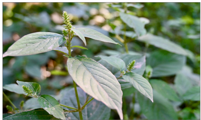
Fig. 1. Chaff flower can form a dense stand, crowding out other plant species.