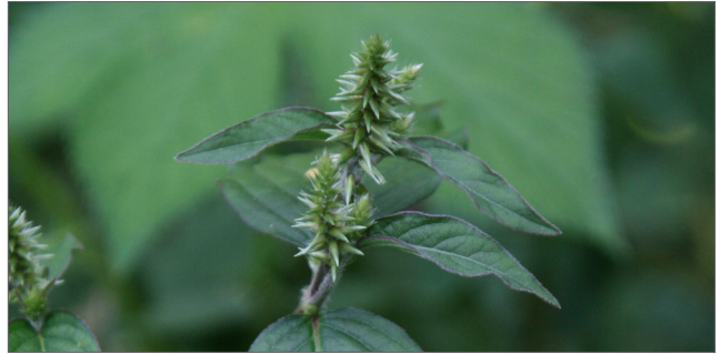
Fig. 6. Flowers are green and arranged in a bottlebrush-type spike that elongates as seeds develop.