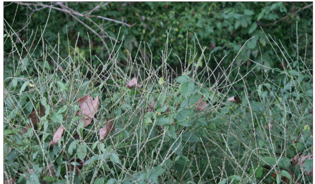
Fig. 7. Seeds of chaff flower develop on long spikes that persist through the winter as a tan hatch.