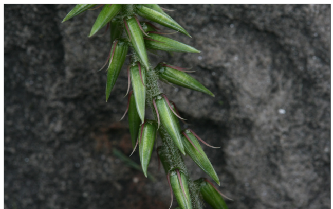
Fig. 8. Stiff bracts at the base of seeds allows them to stick to fur and clothing, making it easy to accidentally transport chaff flower.