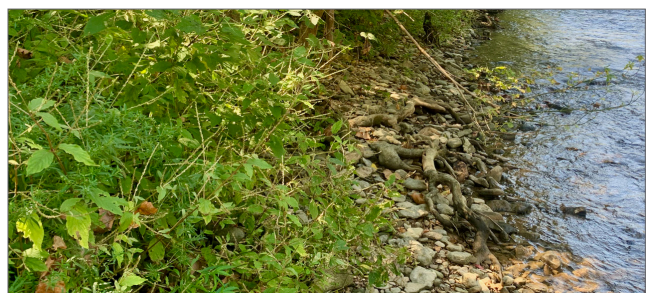
Fig. 3. Chaff flower's initial spread typically follows along riverbanks but it can also spread into upland habitats.