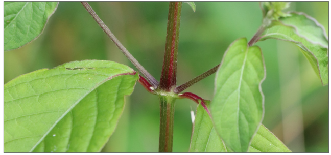
Fig. 5. Stems of chaff flower have a square shape and can have a red color, particularly at nodes.