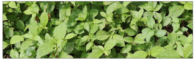
Fig. 9. Immature, pre-reproductive plants.